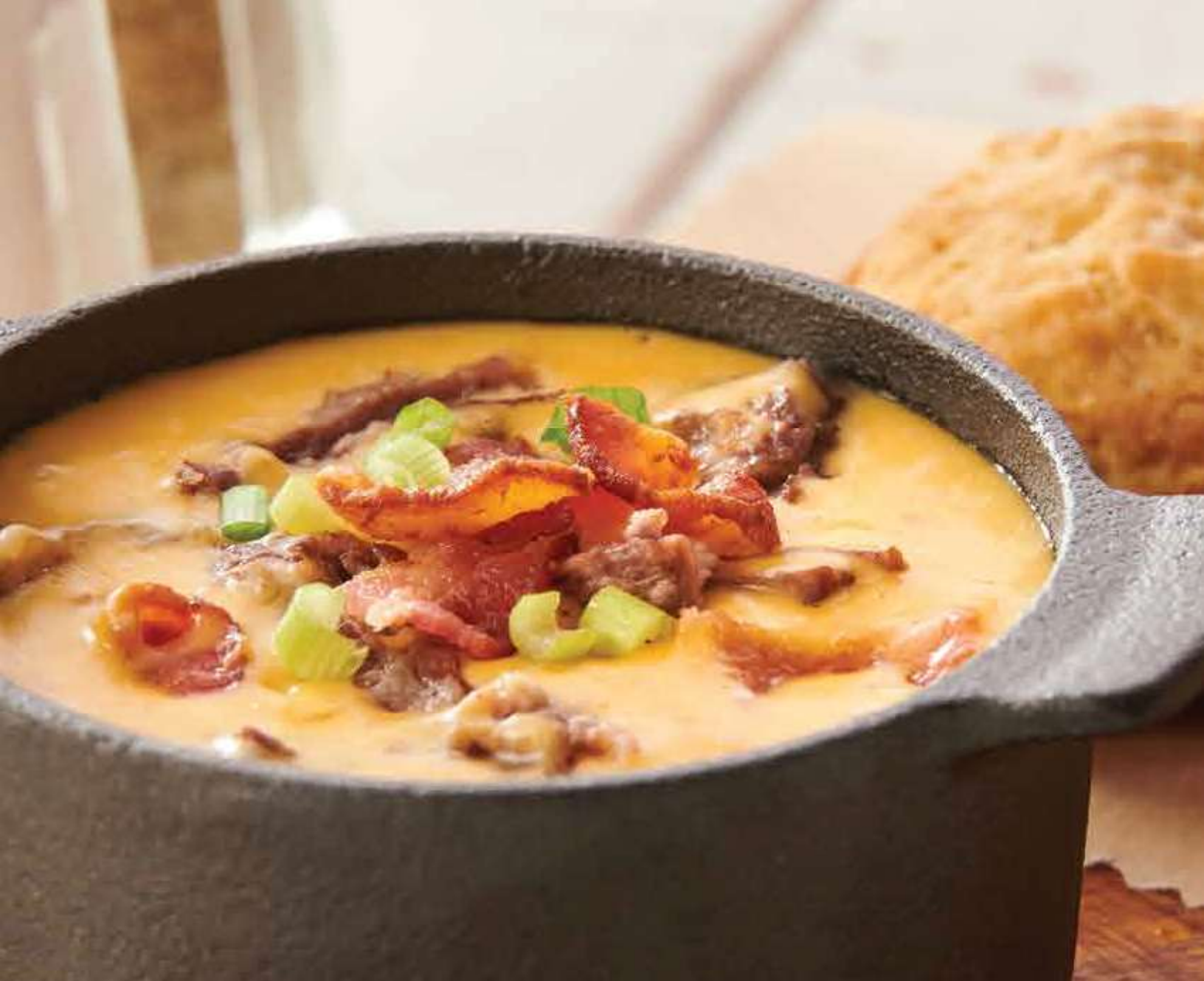
BBQ Short Rib Cheese Soup