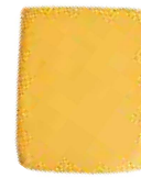
Block / Loaf