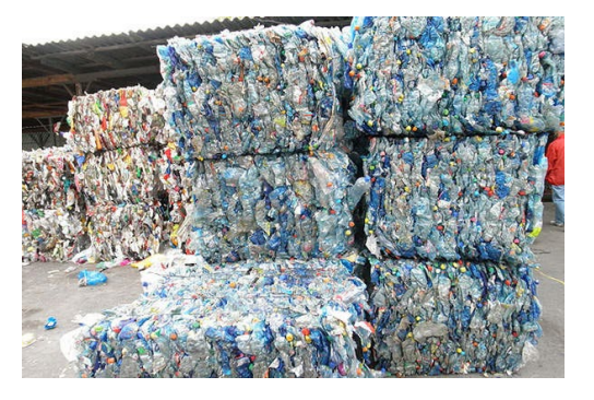
CURRENT PROJECT: Laut Yang Tenang, Indonesia